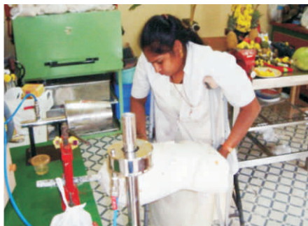
Noorjan at work

Ms. Marika from MIBLOU, Switzerland donated Rs. 56,937.42 for vacutech machine. The vacutech machine is used for moulding and lamination. The machine's major strengths include high vacuum pressure, efficiency, and best-in-class moulding